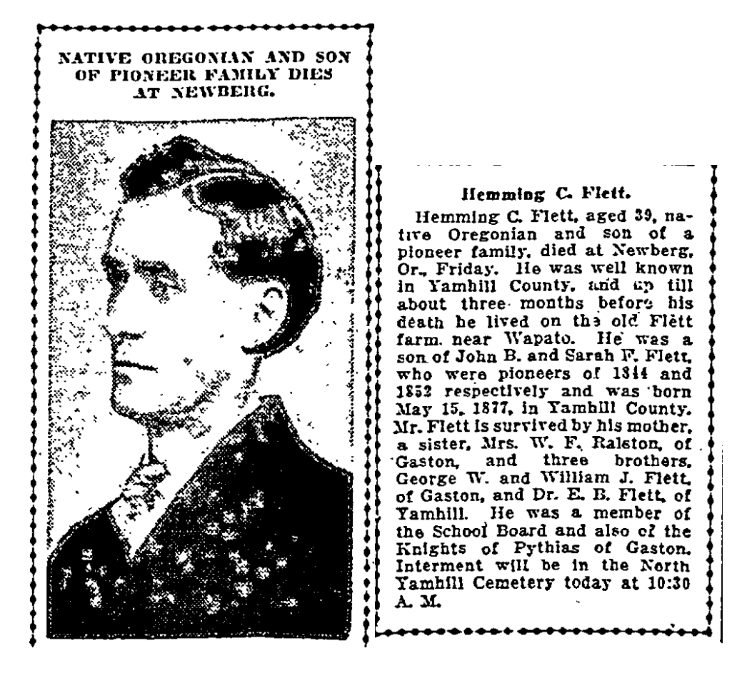
[Sunday Oregonian, Portland, Oregon, August 22, 1915 Sec 1 p.14]