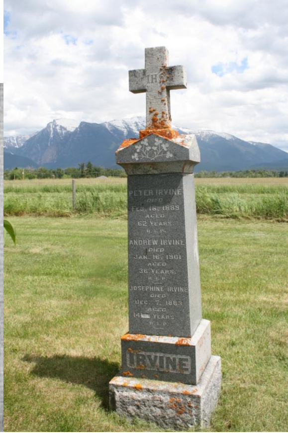
June 2010