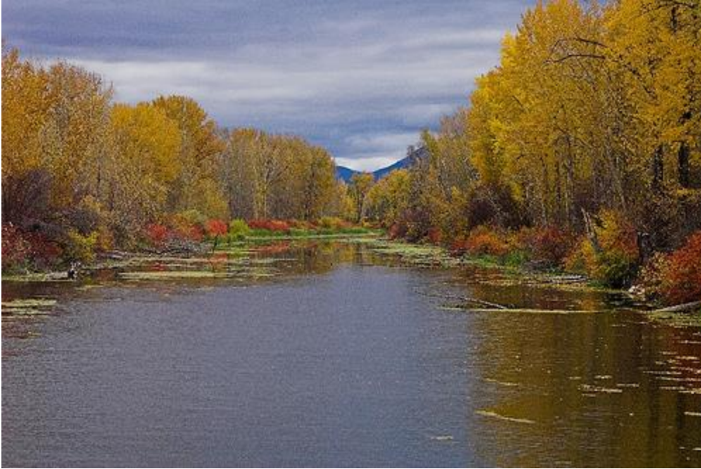
Ashley Creek