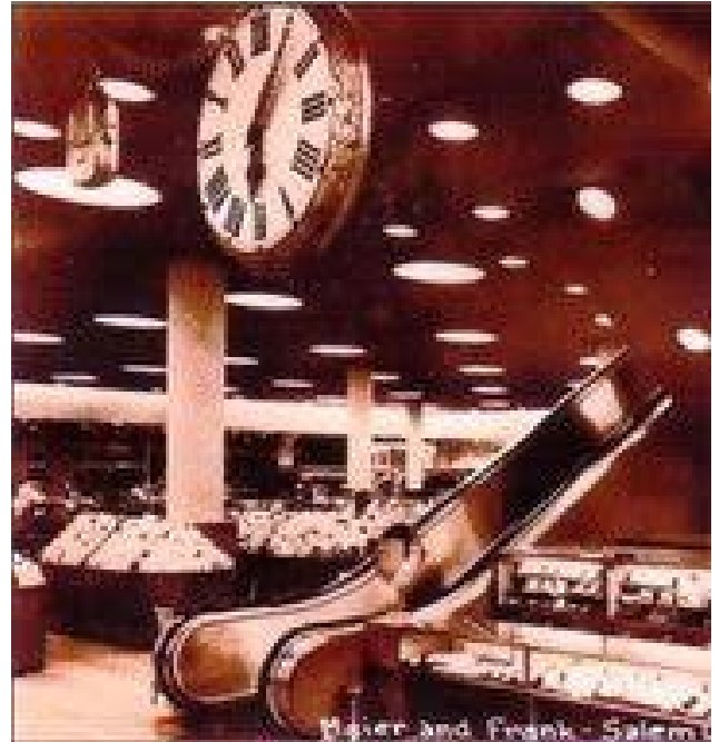
The clock inside Meier and Frank 1955

winter ware rotated. In a toy window, electric trains circled dolls and dinosaurs while a suspended Santa and sleigh flew above it all. Remember Ralphie seeing the BB gun in the 1939 store window in the movie "The Christmas Story" and you have a perfect picture of all this.