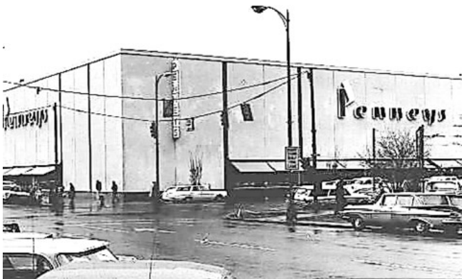
Pennys in Salem in 1965

Granted, the big box stores still retain a remnant of the former Christmas season with some decorations, a bell ringer at the entrance maybe even a Santa Claus. But when the stand-alone department stores closed or became one more store in a sprawling shopping mall, some of the holiday shopping experience went away.