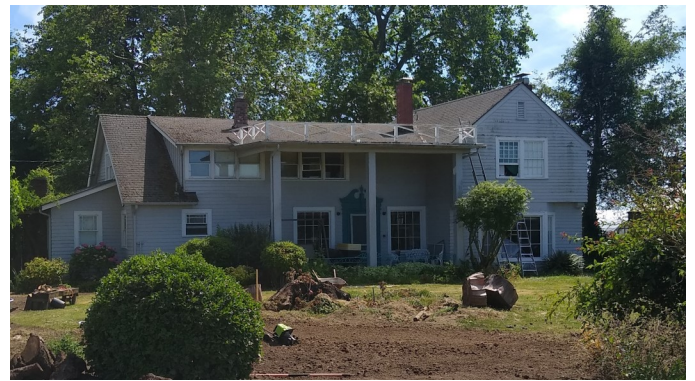
The Hayes house today