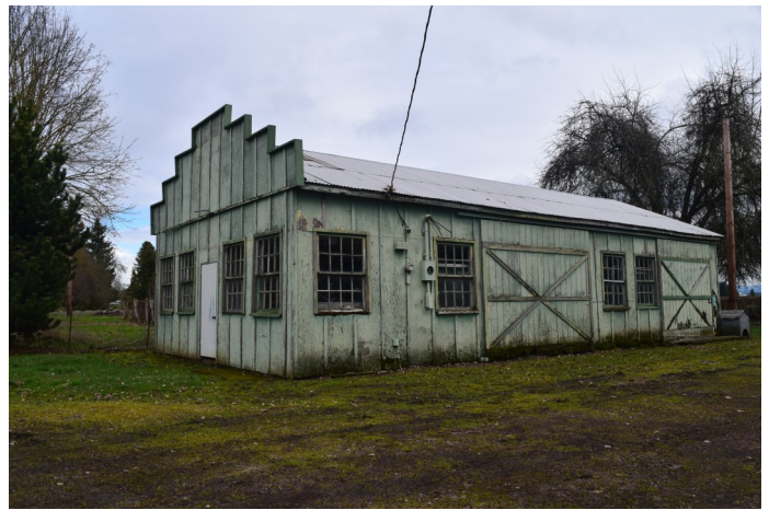
The old Blacksmith shop—2017