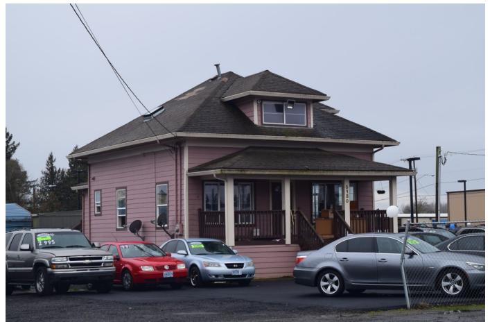
The former White residence— 2017