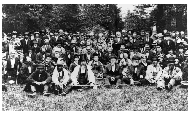
June 7, 1874, 1,500 people were part of the French Prairie Reunion in Aurora.

The 44th annual Strawberry Social on June 22, 2014, at Aurora Colony Museum will be a celebration of an amazing reunion 140 years ago. On