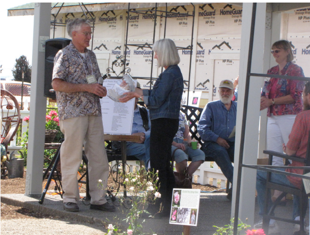
King with engraved bowl

Lots of volunteer time went into the garden; building and painting the picket fence, site and soil preparation, finding and obtaining and planting the roses, creating the walkways and the shelter, obtaining the benches, and donation of rustic outdoor furniture. Laura created an extensive exhibit related to the roses in the garden and placed it in the Brooks Depot Museum.