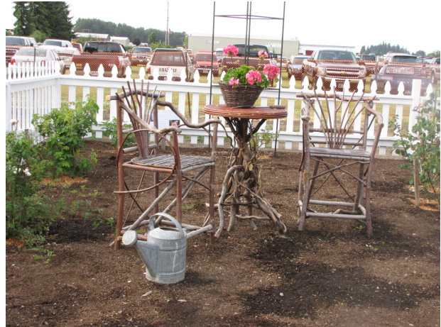
A cozy corner in the garden

Lots of volunteer time went into the garden; building and painting the picket fence, site and soil preparation, finding and obtaining and planting the roses, creating the walkways and the shelter, obtaining the benches, and donation of rustic outdoor furniture. Laura created an extensive exhibit related to the roses in the garden and placed it in the Brooks Depot Museum.